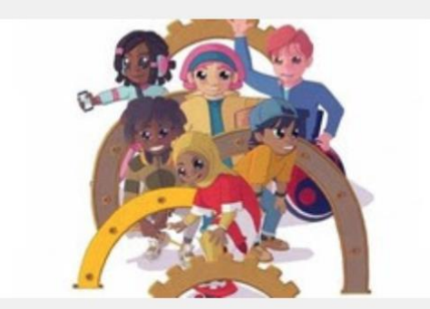
Wednesday 27 July, 4pm Online Event: Booking via Eventbrite

Lambeth Libraries Chatterbooks Group – A Gadgeteers Quiz