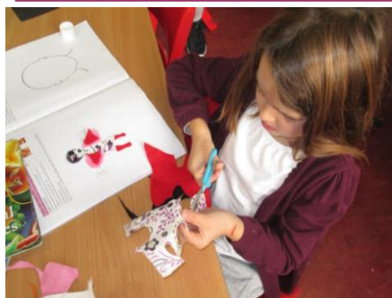
Art Day in Year 2 Koala Class

On Wednesday 14 th October, our Year 5 children attended a Equaliteach Think Workshop. They gained an understanding about stereotyping and contributed their ideas to the whole class discussions.