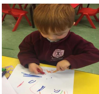
Creative Play in Butterfly Class